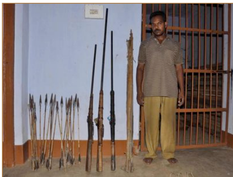
Country-made guns and bows and arrows seized at at Dhobighat, Thakurmunda Range, on 12 June 2010