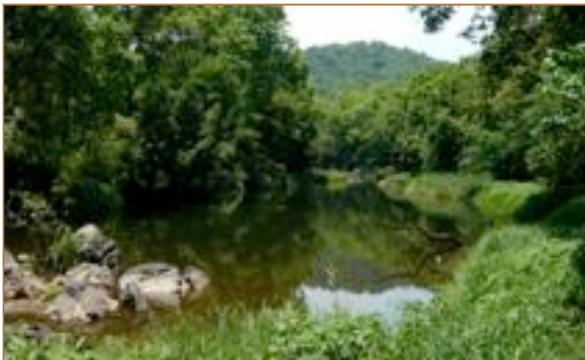
Near the Mondama Hills

In 2008, the Wildlife Institute of India reported a population of 21 tigers in Simlipal. The census carried out by the Orissa Forest Department in January 2009, reported the somewhat optimistic figure of 47 adult tigers. However, we were happy to note that the Department is now using WII's figure. Tiger sightings have never been frequent in the thick vegetation of Simlipal. The Field Director, who joined his post in July 2009, is yet to see a tiger, as is the case with the Deputy Director. Of the field staff we questioned, one had sighted a tiger in December 2009, while others said that they usually find a set of pugmarks after a gap of between 10 days to two months.