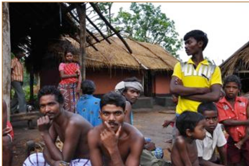
Kerketbeda village, Thakurmunda Range, 16 June 2010

The clear message was that local people's participation is essential and that "truth must prevail if Simlipal is to survive."