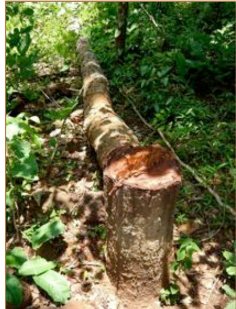
Freshly felled Sal tree, 9 June 2010