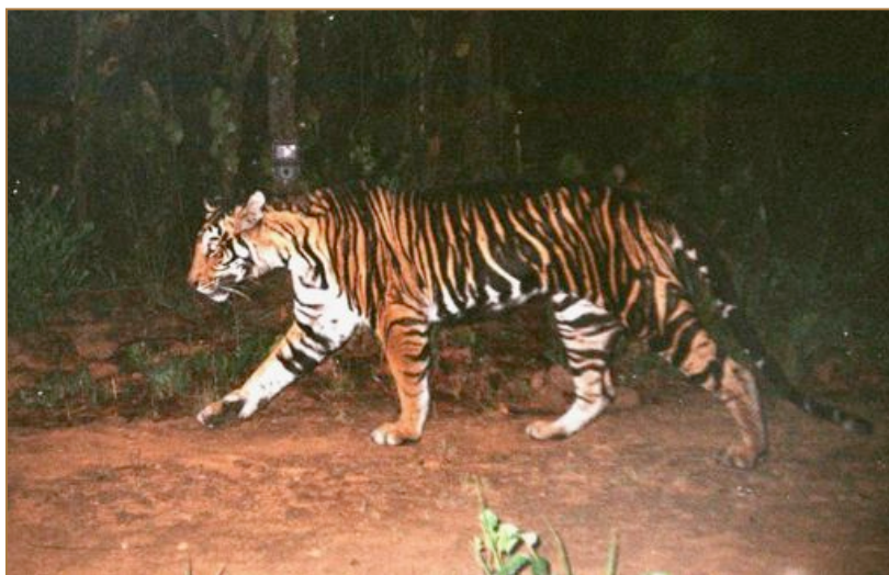
Simlipal is the only place in the world that has recorded “black tigers”. This is one of a number of reasons why it is imperative that Simlipal Tiger Reserve receives the highest degree of protection and support, and that it is managed professionally, with dedication and diligence.