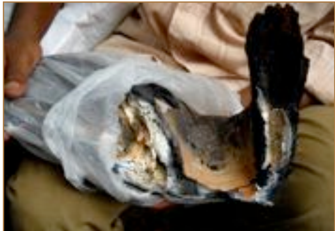
No. 4 - Charred bone in the custody of DFO Baripada

There was no skull, but two charred bones (one looks like a large tusk casing) from this site were handed over to the DO Baripada for further investigation.