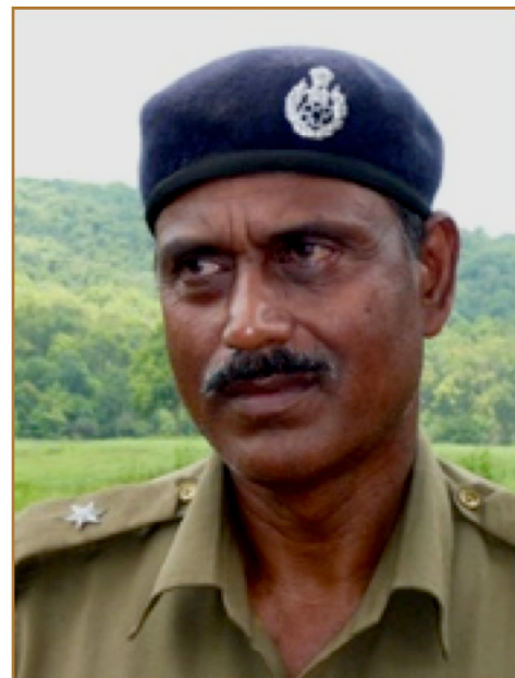
Forester at UBK who has completed 36 years of service in STR, without a promotion

Another issue appears to be promotion. This is an issue that must be addressed; some of the field staff have been working in the same grade for over 36 years.