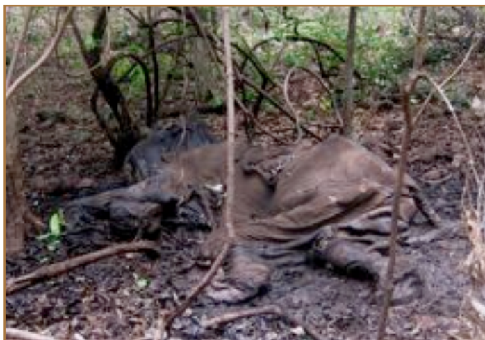
No.3 Adult male, Kachhudan Beat