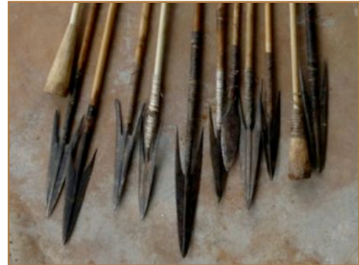
Arrows seized by UBK field staff, 10 June 2010

On 8 June 2010, the authors found a large, dead sambar stag with a wound in its side, lying about 20 metres beside the road, while driving between UBK and Patbil. The post mortem revealed that it had been killed by a metal arrowhead that was found embedded in its body.