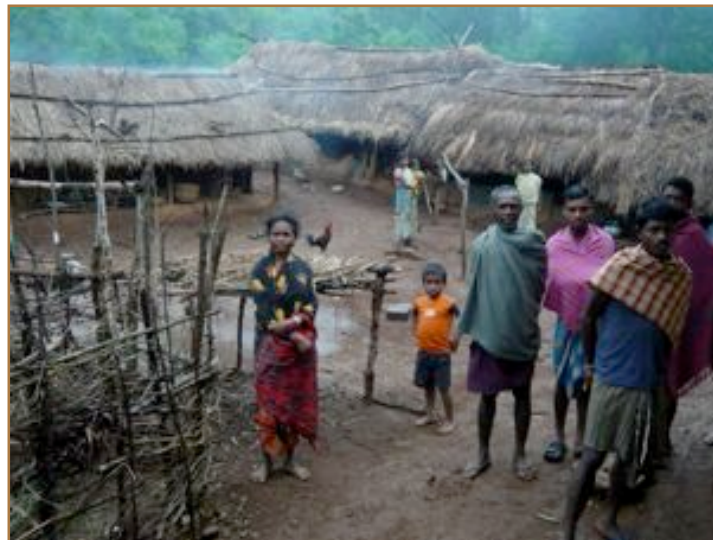
The small Kharia hamlet at Bahaghar

This important transition is in the early stages of happening. A systematic, scientific and ongoing attempt should be made to assess tiger density and prey populations. It should be carried out in partnership with WII.